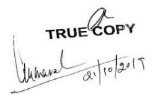
Authorised Officer Allahabad Bank